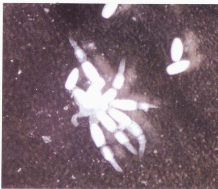
FIG. 4. Ovaries of a 6-day old adult.