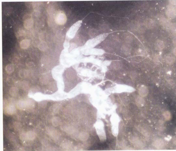
FIG.1. Ovaries of a 5-day old pupa.