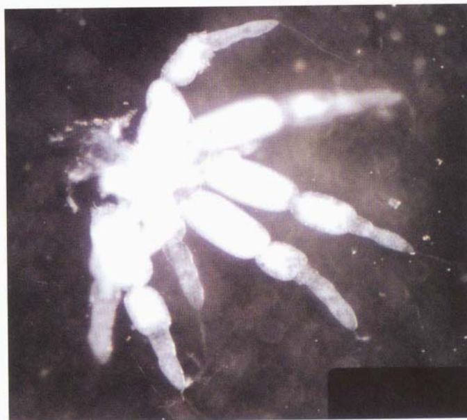
FIG. 2. Ovaries of a L. serricornis adult inside the pupal cell, before its emergence.