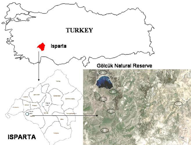
FIG. 1. Map of sampling sites.

The greatest diversity was found at site B (98 species), followed by site E (91 species) (Table 1). Estimated absolute number of species in all sites was 395, which means that 46% of coleopteran fauna is still undiscovered at the GNP. Site B harbored the highest abundance of Coleoptera, where 33% of all sampled Coleoptera was collected (site C - 26%, site A - 17%, site F - 13%, site E - 10% and site D only 0.6%). 76% of the recorded families were represented in site A. The number of families found in sites A and B were 26 and 24 respectively (Table 2). The number of families in sites C and E was 22 respectively, and sites F and D had 19 and 9 families respectively. Coleopteran families were found to be unequally partitioned in all four sampling sites. The lowest number of samples was recorded from site D (0.6%), which also had lowest number of families as