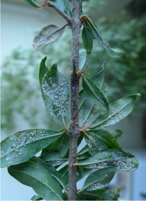
FIG. 1. Pomegranate leaves infested by S. phillyrae .