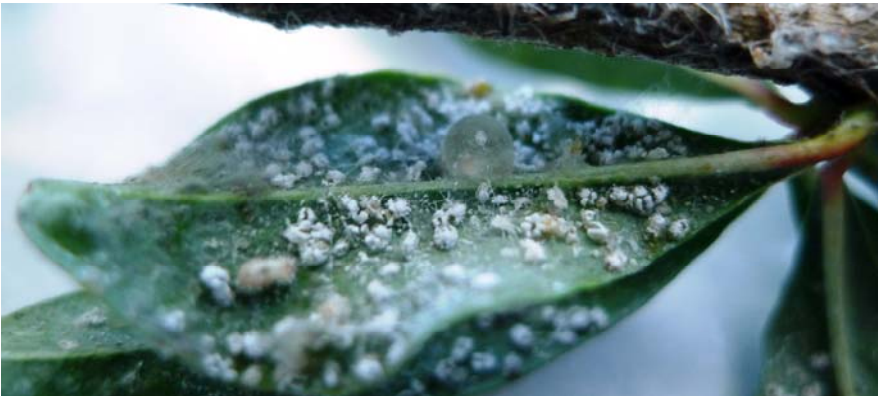
FIG. 4. Colony of S. phillyrae with honeydew excretions on pomegranate leaf.