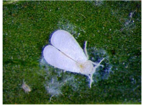
FIG. 2. Adult of S. phillyrae .