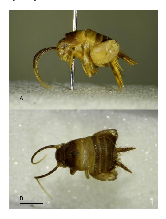
FIG. 1. Holotype of Myrmecophilus balcanicus sp. n. (male), lateral (A) and dorsal (B) view. Scale bar, 1 mm.

colour, dark ochreous, except the posterior of the pronotum, the complete mesonotum and the posterior margins of tergites 1-3, which are contrasting pale ochreous. Pronotum and tergites densely covered with inclined, distant, relatively short and shiny hairs. Antennae are about as long as the body and dark ochreous, and the first two segments are pale ochreous. Palpi, ochreous. Eyes are black. Hind legs: hind femur, 1.4 times as long as wide; hind tibia with four inner subapical spurs, where the first and third spurs are shorter than the second and the fourth, and the third spur is slightly shorter than the first spur; hind tibia with three inner apical spurs.