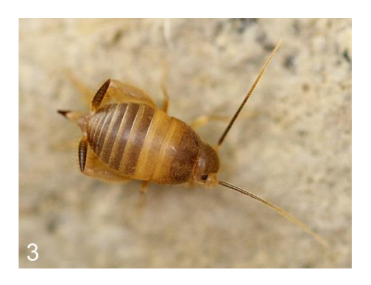
FIG. 3. Paratype of Myrmecophilus balcanicus sp. n. (female).

three dorsal spines in M. hirticaudus and M. termitophilus, which are positioned in the proximal, medial and distal parts of the basitarsus, where the spine is sometimes absent in the medial position, but the spines in the proximal and distal positions are always present); contrasting pale ochreous posterior pronotum, the the complete mesonotum, and the posterior margins of tergites 1–3 (contrasting pale ochreous posterior third of the pronotum; posterior third of the mesonotum and the posterior margins of tergites 1-3 pale ochreous in M. acervorum; borders absent or faint in M. nonveilleri. M hirticaudus and M termitophilus).