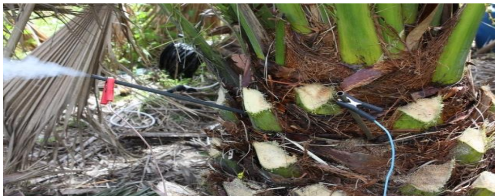
FIG 2: Electric voltage applied to the palm tree through electrodes.