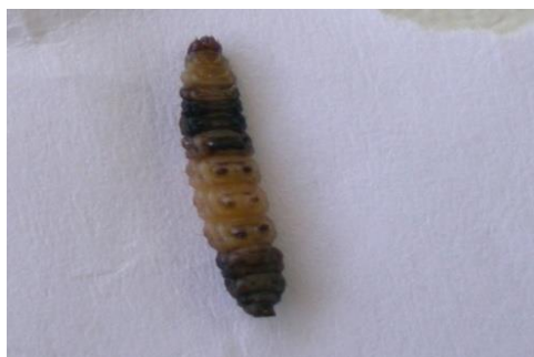
FIG. 3. Ephestia kuehniella larva infected with B.t.k. The black spots indicate the bacillus infection.