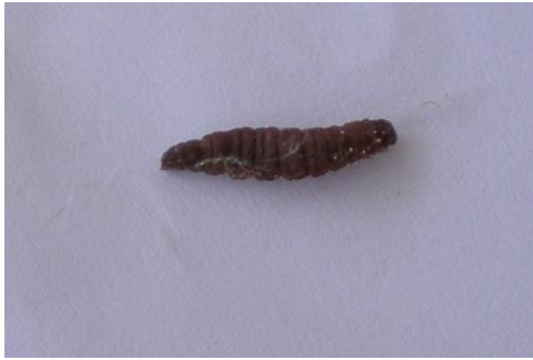
FIG. 4. Ephestia kuehniella larva infected with H. bacteriophora . White to pink discoloration suggests the presence of nematodes.

Finally, according to our observations, B. thuringiensis toxins, especially at 1500ppm and 3000ppm, are most likely responsible for larval mortality. In these combined treatments, pathogen interaction, which was initially additive (7 days), had developed into a competitive interaction by the end of the experiment. In contrast, at 500ppm of B. thuringiensis combined with H. bacteriophora , pathogen interaction was synergistic throughout the duration of the test, which leads us to believe that, at this specific dose, the two pathogens complement each other. At this dose, with a low concentration of the bacillus and the nematodes, the body of the larvae exhibited black spots on the thorax, head and anus while anterior to the abdomen the larva displayed a white to light pink discoloration (Fig. 2). These symptoms point to the simultaneous reaction of the two pathogens as stated in Nielsen-LeRoux et al. (2012). The black spots indicate the bacillus infection (Fig. 3), while white to pink discoloration suggests the presence of nematodes (Fig. 4). The same synergistic effect was observed with B. thuringiensis and Xenorhabdus nematophila against E. kuehniella larvae and could be explained by the role of delta-endotoxins in opening the way for X. nematophila to infect the hemolymph (BenFarhat et al. 2013).