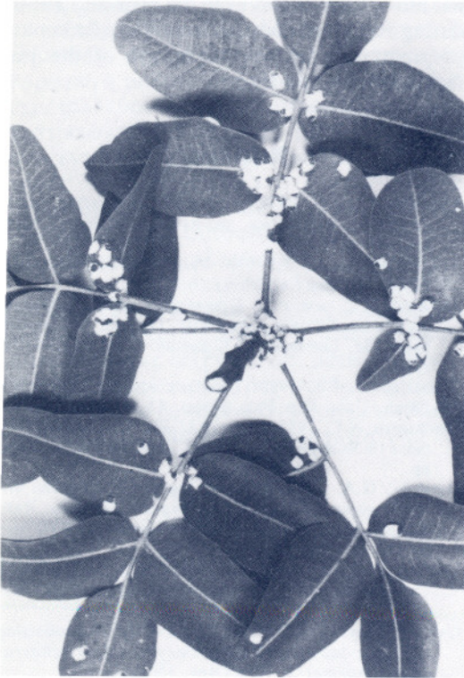
FIG. 1. Adults in oviposition stage on twigs, leaf-petioles and leaves.