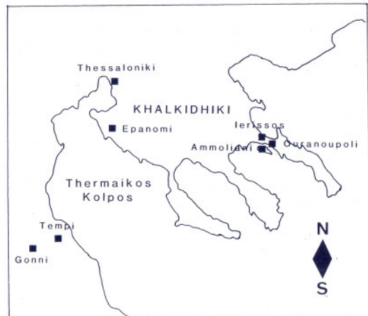
FIG. Black quadrangles represent the areas in central Northern Greece, where samples of flies, larvae and pupae were obtained.

All fractionation procedures on the immature and adult D. oleae were performed on ice or at 4^{\circ}\text{C} . Aliquots of larvae, pupae or flies were macerated