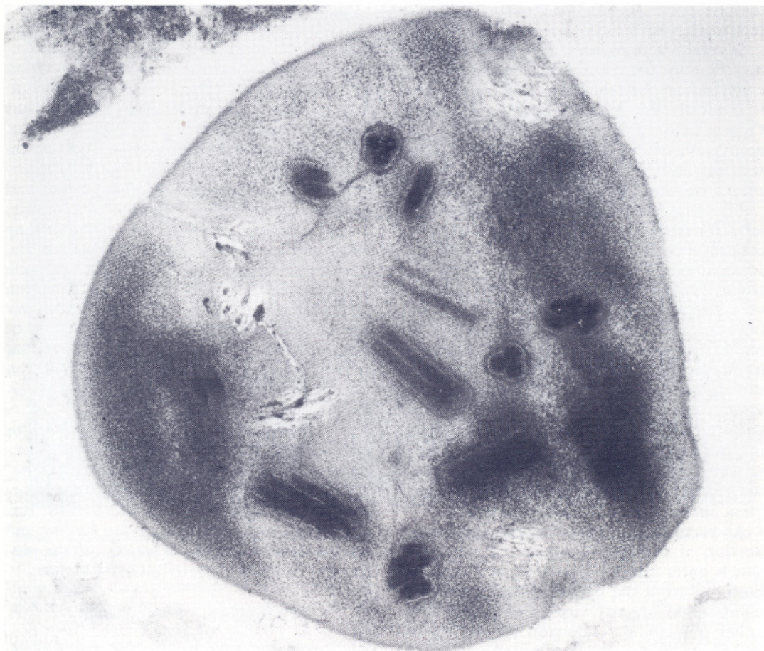
FIG. 1. Electronmicrograph of nuclear polyhedrosis virus inclusion body from Gonometta podocarpi : The virus particles are easily distinguished with one to several nucleocapsids. Mg \times 65,000.

because they are potentially useful control agents. In the absence of any mammalian virus which produces polyhedra, and the physiochemical differences between for example the baculoviruses and known mammalian viruses it is more acceptable to use these viruses as biological control agents (after stringent safety testing).