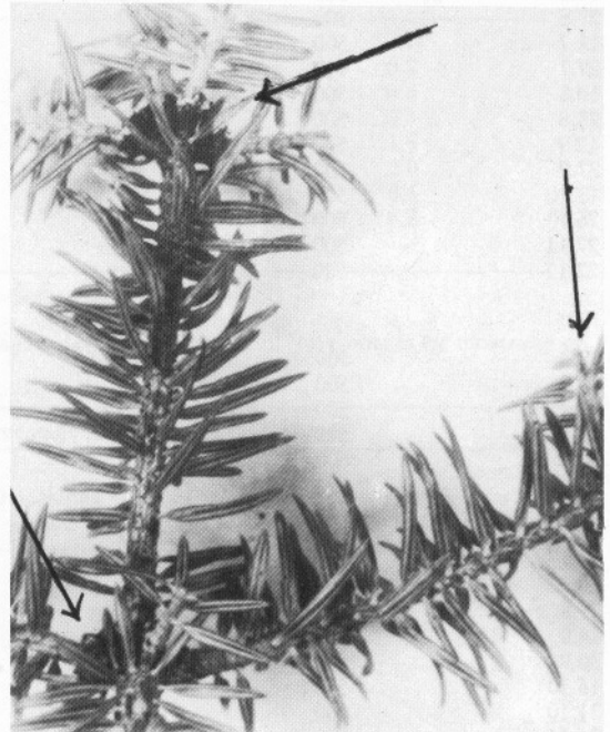
FIG. 1. Adults of P. hemicryphus at oviposition on fir forks of A. cephalonica in Mount Parnitha, June 1985.

The young adults started to oviposit early in May and till July all scales were ovipositing (Fig. 1). The number of eggs laid varied from 82 to 1,486 (Table 3). Kailidis and Georgevits (1971) reported that eggs vary from 40 to 450. According to Schmutterer (1956) the number of