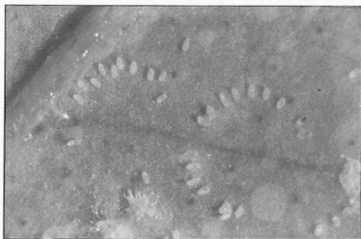
FIG. 2. Eggs of Aleurothrixus floccosus laid in circles.

brownish in colour and long curved oval in shape. They are usually laid in circles as the female revolves with her inserted rostrum acting as a pivot during deposition (Fig. 2). The first nymphal stage is light green in colour. The wooly covering appears during the second nymphal stage and greatly increases in size during the third and fourth preimaginal instars. The adults are pale yellowish. They seldom fly and, even when they do, they fly rather short distances. The insect lives and oviposits on the under surfaces of leaves.