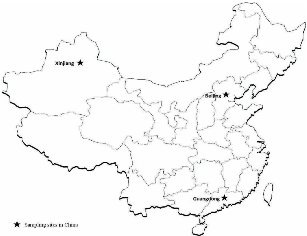
FIG. 2. Sampling sites in China.